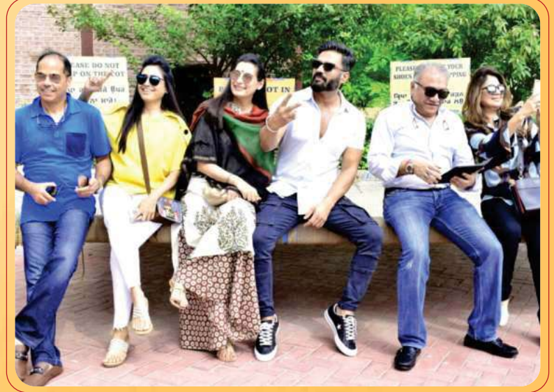
Sunil Shetty, Bollywood Actor