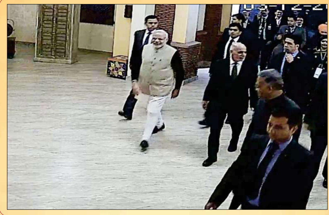
Hon'ble Prime Minister of India Shri Narendra Modi visited Sadda Pind