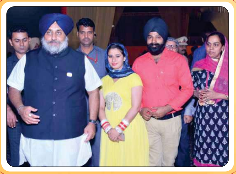
Deputy CM of Punjab Sukhbir Singh Badal lays the foundation of Sadda Pind